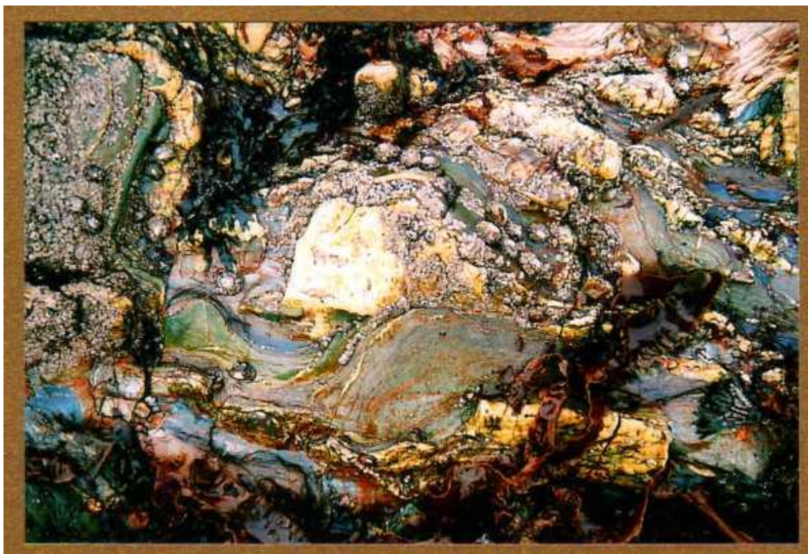
The Kandinsky-reminiscent nature photography of Rhona MacKinnon will be exhibited in the Pearce Institute Café over the conference weekend

12. Chill-out in the Café continued (see 6 above).