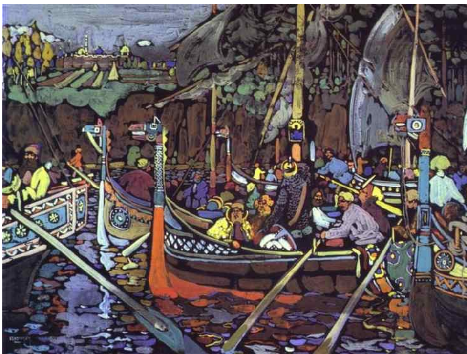
Volga Song, Wassily Kandinsky, 1906