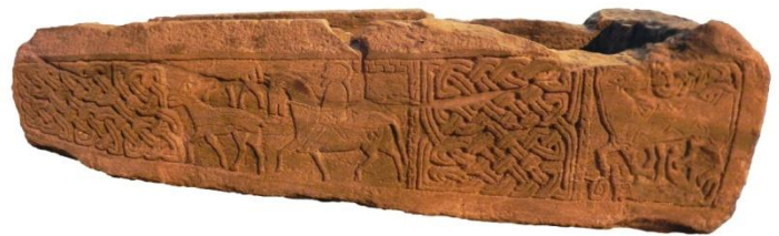
St Constantine’s Sarcophagus, Govan Old Parish Church