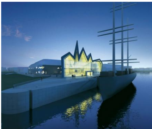
Glasgow’s new Riverside Museum