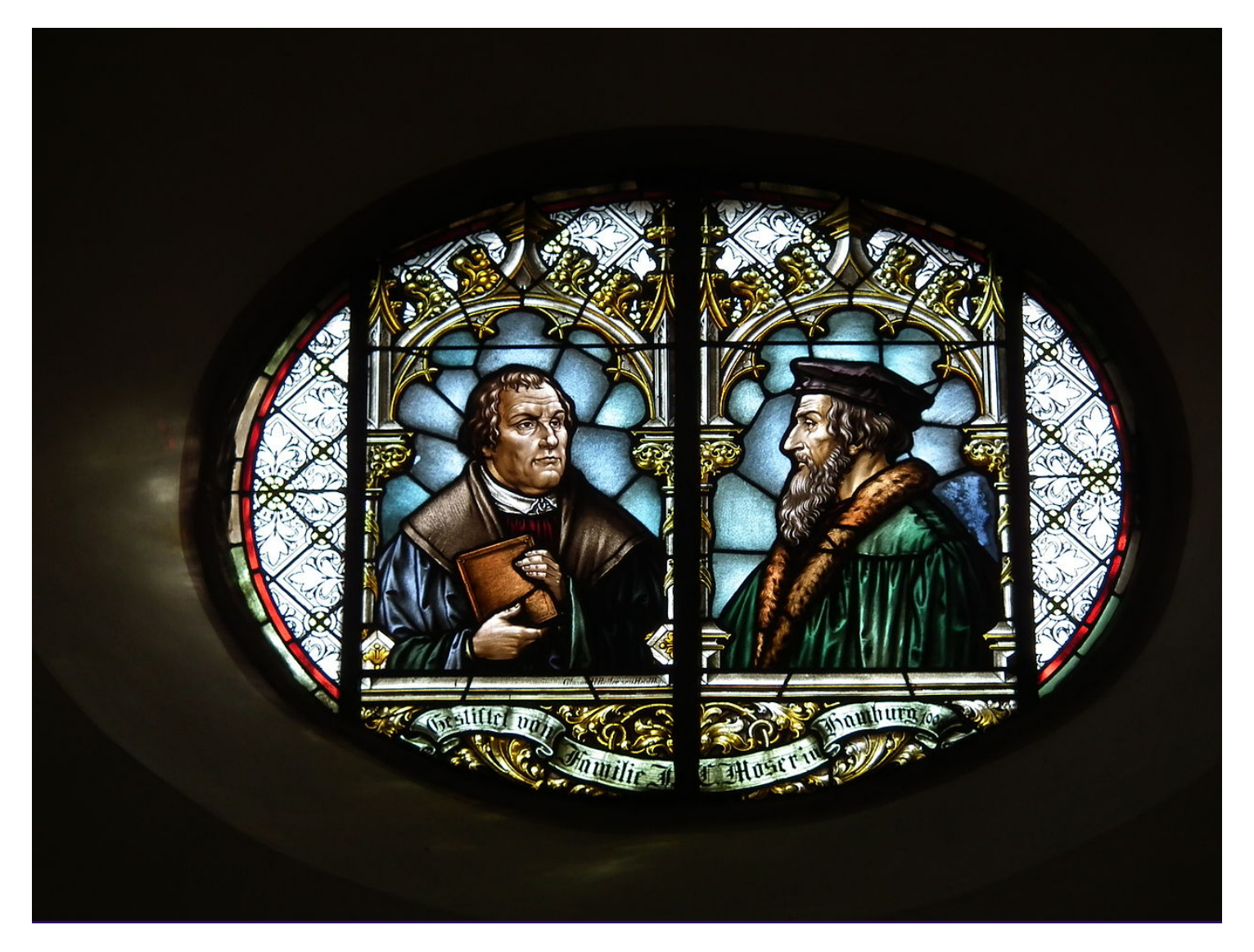
(http://bellacaledonia.org.uk/wp-content/uploads/2016/11/6-Luther-and-Calvin.ipg)2. Reformation Evangelicalism and Blood Sacrifice

In contrast to this social evangel (or gospel), the 16th century Protestant reformers, starting with Luther, narrowed down their usage of the term to focus on personal salvation. Why that shift from the social to the personal? In principle, there ought to be no contradiction between the two. The Reformers probably assumed that. To be an evangelist or evangelical should be the same thing. There is no etymological difference. However, as the Oxford English Dictionary puts it, "evangelical" has come to be: "Applied to those Protestants who hold that the essence of the Gospel consists in the doctrine of salvation by faith in the atoning death of Christ, and deny the saving efficacy of either good works or the sacraments."